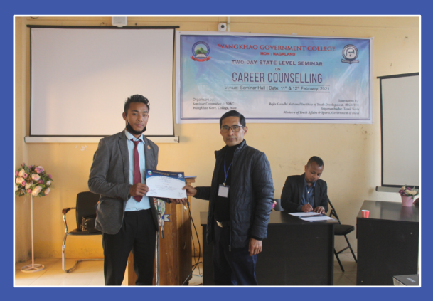
Certificate given to all the participants